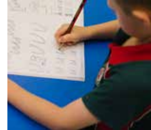
Page 10 | NCC | Prep Orientation | 2023